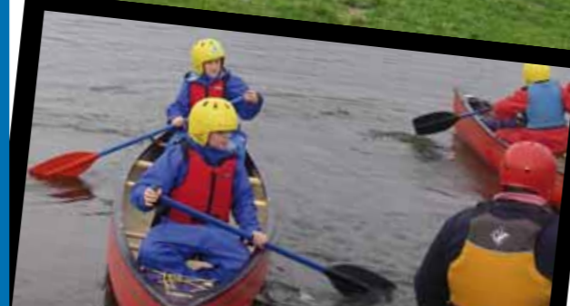
Craigmillar Youth Challenge