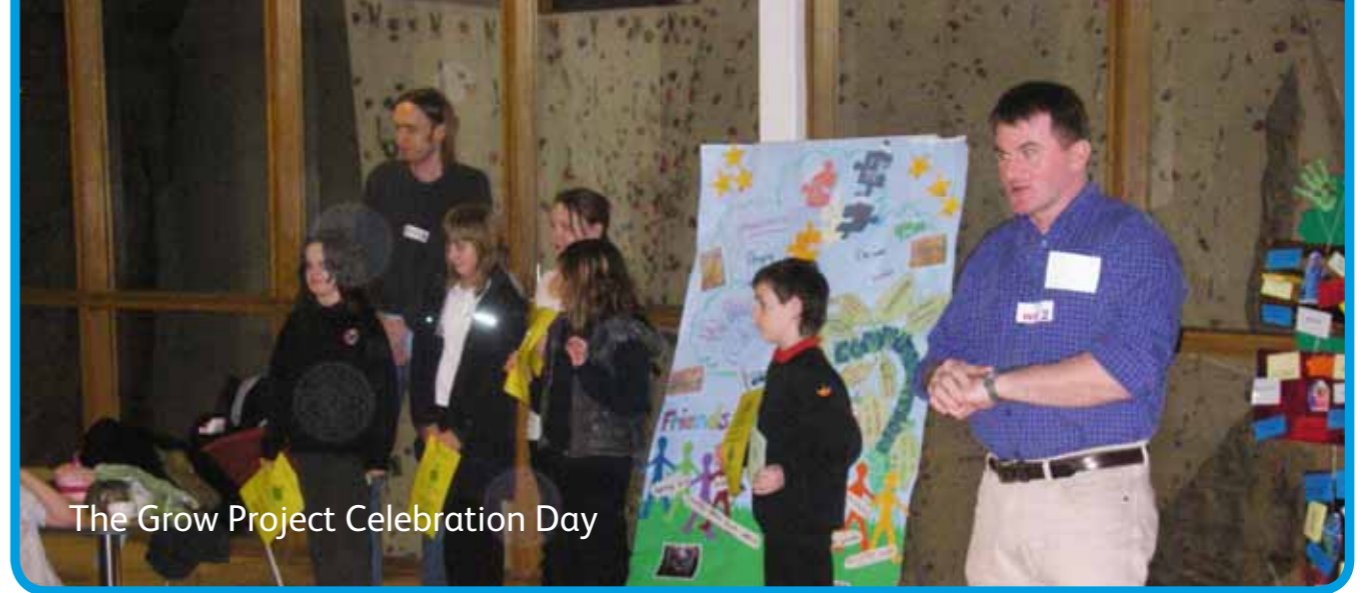
The Grow Project Celebration Day