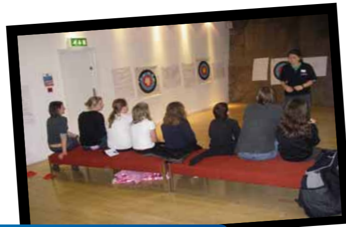
Craigmillar Youth Challenge

CYC is a long established multi agency partnership group working across professional boundaries to offer both universal and targeted holiday provision in the greater Craigmillar area. Capro gives the CYC office space, administrative support and outdoor instructors and equipment. The Police offer officers to work alongside the young people as well as the other workers from local schools, drugs project, church, East Early Intervention, but importantly the programme is also reliant upon the hard working volunteers and youth helpers. Programmes are designed to be challenging, supportive and fun and include a variety of outdoor education opportunities. Over the summer seven young people achieved their BCU 1 star in open boats. The youth mentors, supported by the Cashback for Communities Fund, also took an active role in the holiday provision. A bumper 636 places were taken up over Easter, Summer and Autumn, allowing young people from P5 to S3 to take part in exciting holiday provision. CYC runs its programme by fundraising efforts.